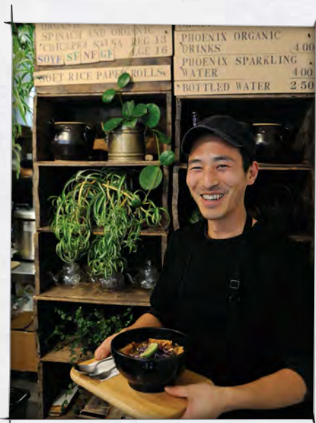
Fresh on Charles, Launceston