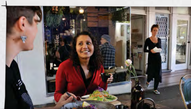
Fresh on Charles, Launceston

Pickled Evenings 135 George Street, Launceston T: 03 6331 0110 www.pickledevenings.com.au