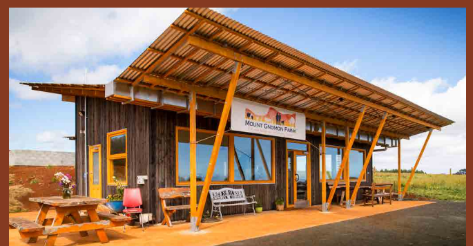
Mount Gnomon Farm

Refuel after shredding Derby's mountain bike trails.