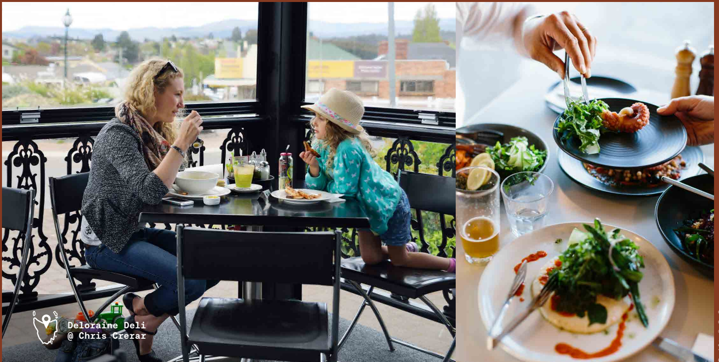
Deloraine Deli