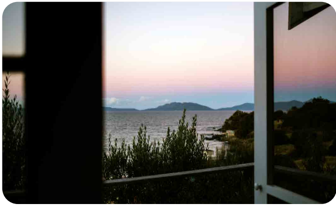
View of Swansea