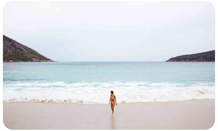
Wineglass Bay Beach