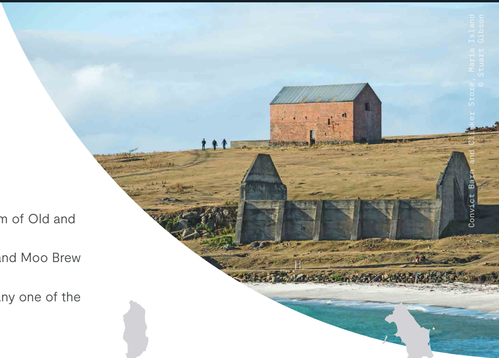
Convict Barn and Clicker Store, Maria Island