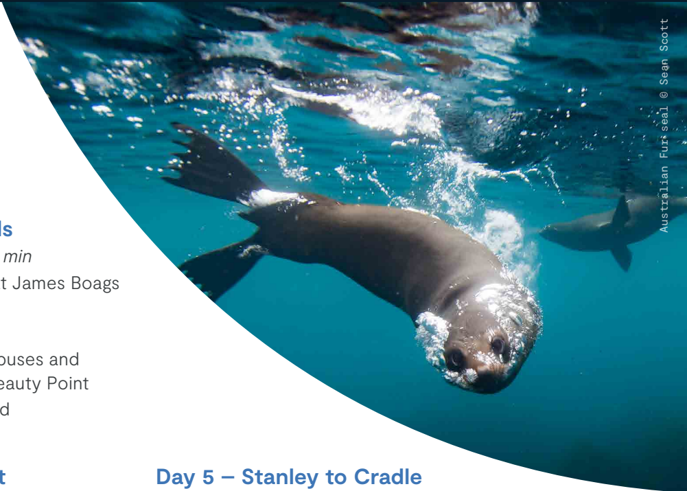
Australian Fur seal