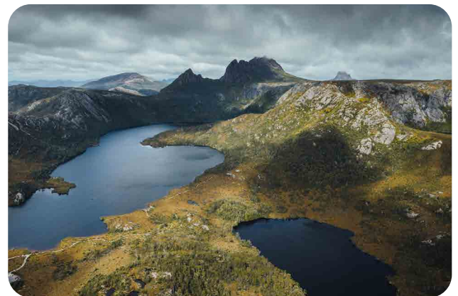
Dove Lake and Crater Lake, Cradle Mountain